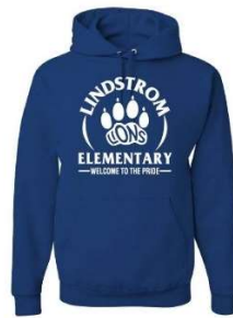
Hooded Pullover Sweatshirt $25