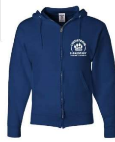
Hooded Sweatshirt with Zipper $28

Multiple student orders can be placed on the same form.