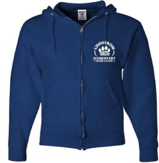
Hooded Sweatshirt with Zipper $28

Multiple student orders can be placed on the same form.