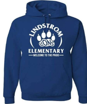
Hooded Pullover Sweatshirt $25